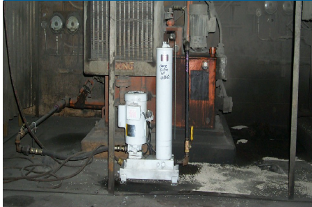
Manifold-mounted off-line filtration system on an FD fan.