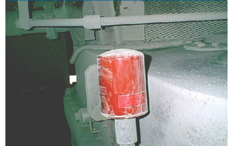
MBF air filter breather on a coal pulverizer.