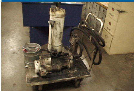
Mobile filtration system for coal pulverizers.