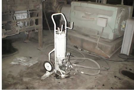
Mobile filtration unit on a coal pulverizer.