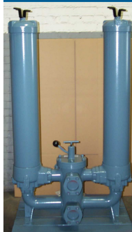
QFD5 duplex filter w/ 6-way duplex valve.