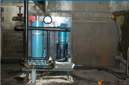
QF2 base-ported filter on a coal pulverizer.