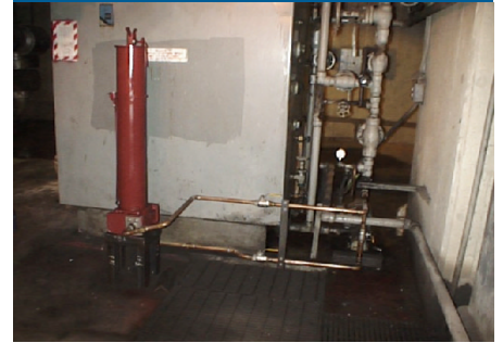
QF2 base-ported filter on a coal pulverizer.