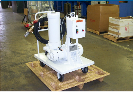
Mobile off-line filtration system for heavy gear oils.