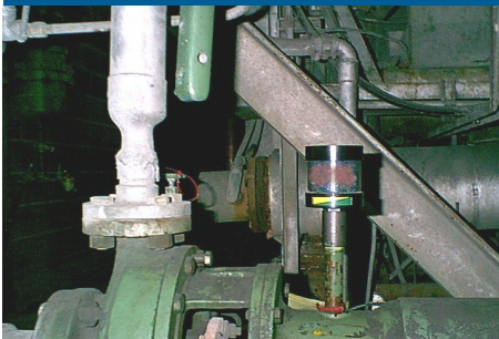
D-AB-2 desiccant air breather on a gear box.