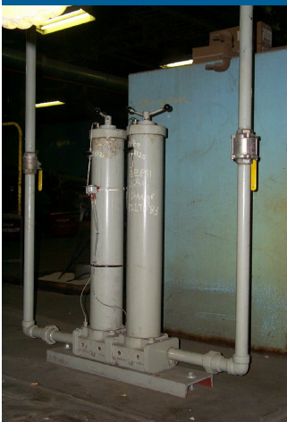
2 QF5's in parallel on a cooling tower's glycol system.