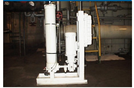
Off-line filtration system on a main turbine lube system.