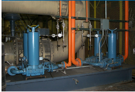
QFD2 duplex filter on a hydrogen gas/oil seal system.